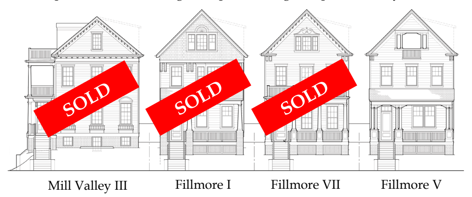
Fillmore V ◆ 2,292+ sq. ft. ◆ 3-6 Beds, 2.5-4.5 Baths ◆ Starting $671,202

Highlights – This gorgeous, west-facing Fillmore XII with unforgettable outdoor spaces is scheduled for a Fall 2019 move-in! Just above the front porch, enjoy a morning cup of coffee in the covered deck straight from the master suite. This Fillmore also features a finished fourth floor loft space with its own covered deck and powder room, making it the perfect hang out spot for family and friends alike.