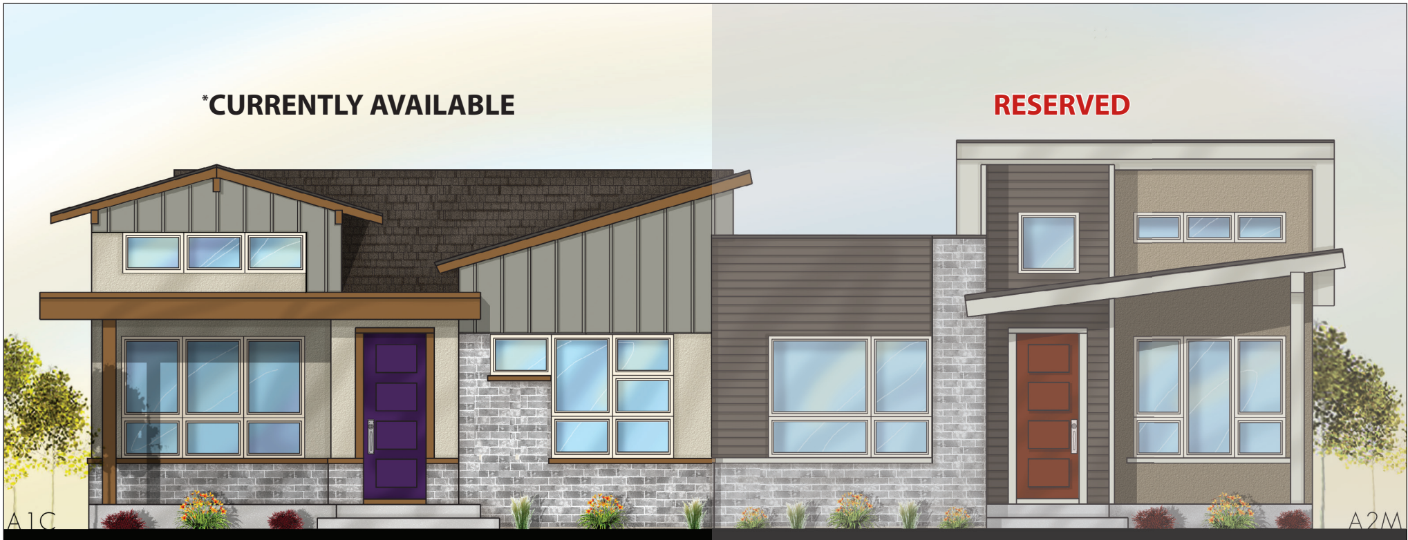
THE APPROACH COLLECTION • A2C • CRAFTSMAN ELEVATION