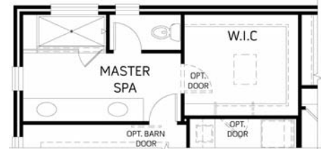
Optional Master Bath Spa