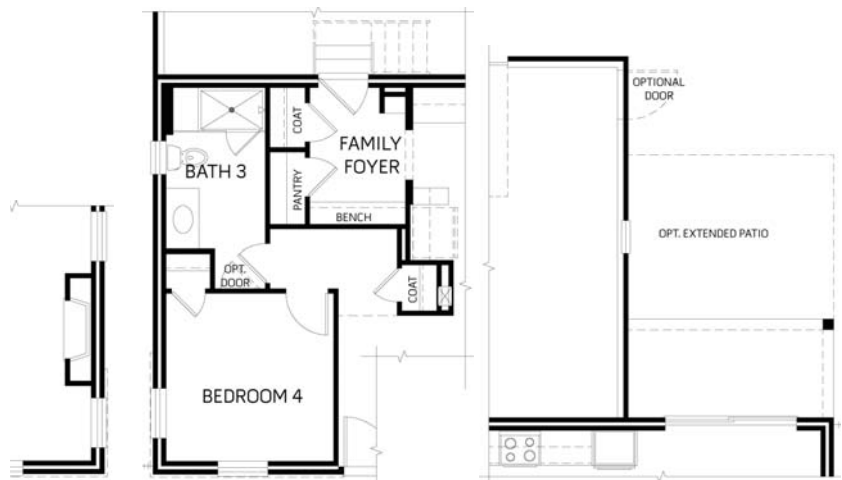
Optional Center Fireplace