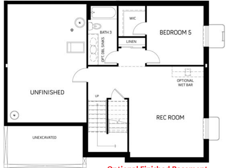
Optional Finished Basement Unfinished Basement is Standard