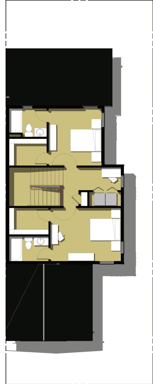
3 UPPER LEVEL - End Unit