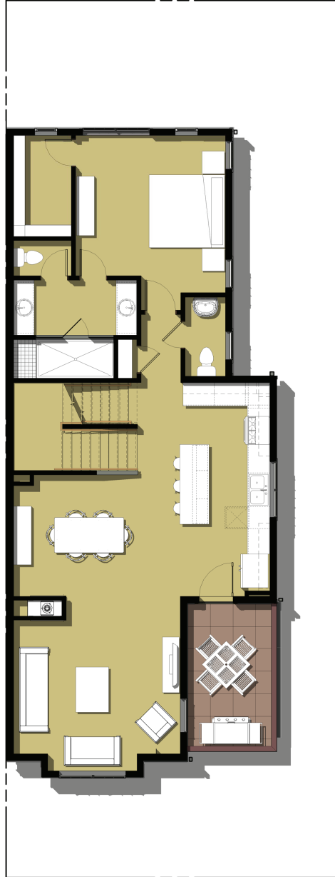
2 MAIN LEVEL - End Unit